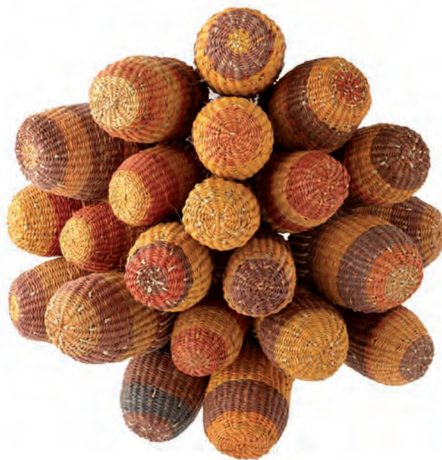
P11: Giringun Artists, Bagu with Jiman , ceramics, overall 165 x 410 x 90cm. Image courtesy the artists. All photographs this article by Regis Martin.

It is not uncommon for bark painters to work on a large scale, and although many oversized examples have been past finalists, size has been less of a motivating factor in this award category. Four of the best works in this year's